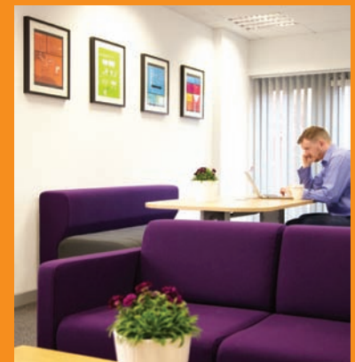
The Welcome room provides an informal area to work and meet