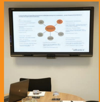
The latest Smart technology