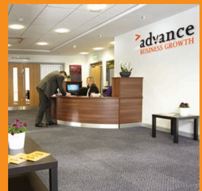
A great working environment