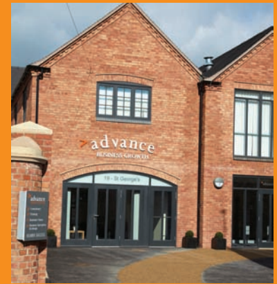
Purpose-built for business

One of the most common barriers to becoming a successful business is the reality that you are doing it alone. Through the Business Enterprise Exchange we want to change that and bring together aspiring entrepreneurs and small business owners, and give them the resources and focus to succeed. Our community philosophy drives the provision of free information sessions, together with a package of facilities and administrative resources that anybody can drop-in and use. We want this community to thrive and grow through our collective success.