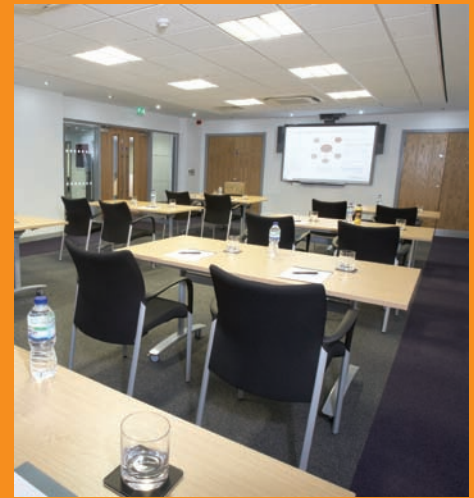
The Conference Room can accommodate a number of different seating formats.