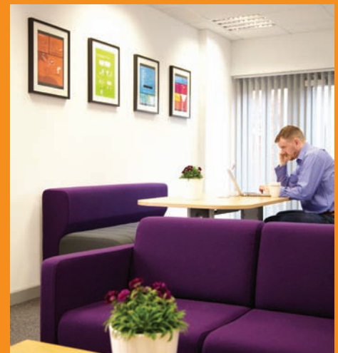
The Welcome Room provides an informal area to work and hold meetings.