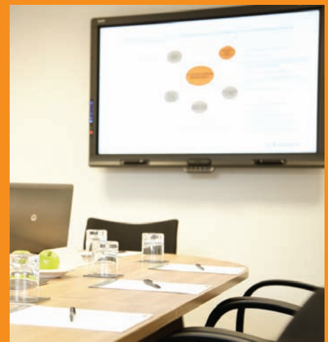
The Business Growth Centre features the latest Smart technology.